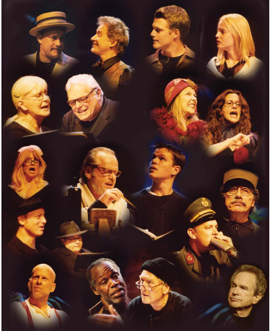
Cast of The World of Nick Adams

On Monday November 4th at The Kodak Theater in Hollywood, California, an extraordinary cast of celebrities gathered together to benefit The Painted Turtle and the entire Association of Hole in the Wall Gang Camps. The World of Nick Adams , based on Ernest Hemingway short stories