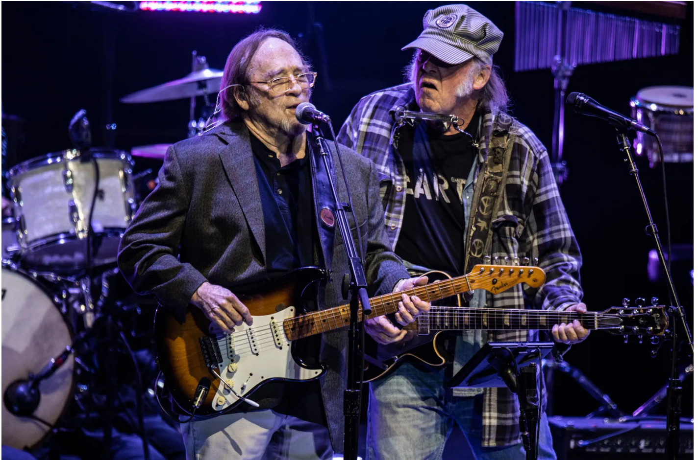
Stephen Stills and Neil Young will perform at an October benefit in California.